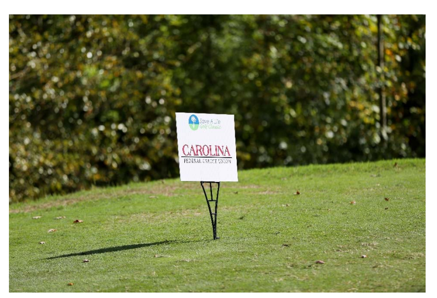
Carolina Federal Credit Union